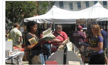
Baltimore Book Festival last year