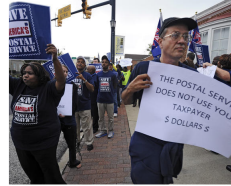
Postal workers protest layoffs, closures in Md., across U.S.