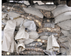
Dollar coins piling up at Baltimore reserve bank