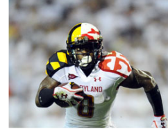
Terps unveil another new set of uniforms